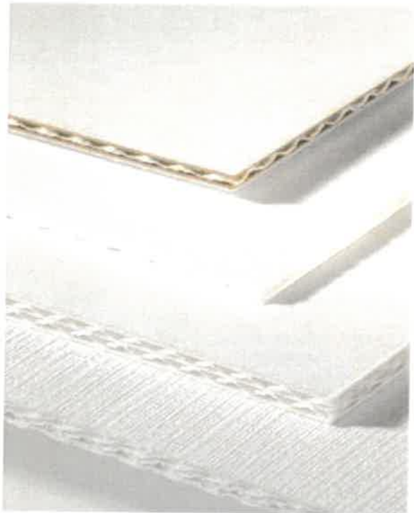
DISPA®outdoor | DISPA® 2.4 mm | DISPA® 3.8 mm | DISPA®canvas