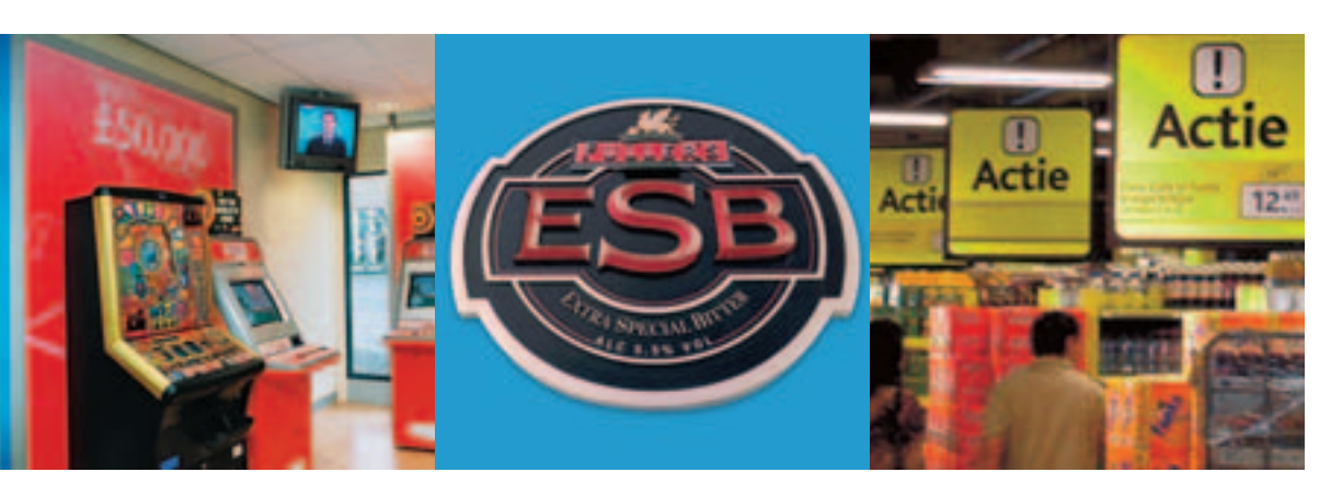
Shop fitting, interior design FOREX®classic